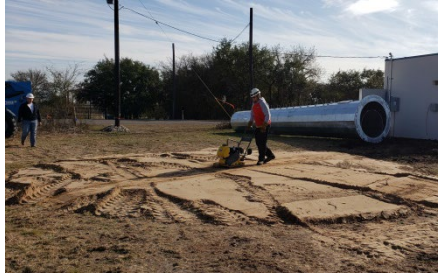
Preparing pad for foundation