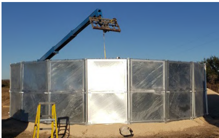
Fully assembled foundation