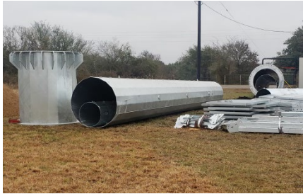
AFS and pole sections off-loaded at site