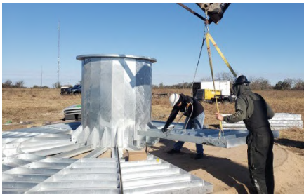
Kingpost and base trays