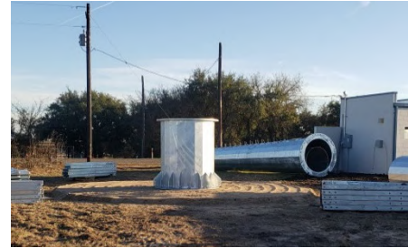
Kingpost on leveled pad