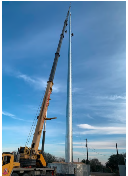
AFS 2000 and 180' pole