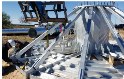
Truss arm assembly